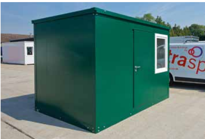
Expandakabin - Flat-packed office unit home and commercial use.