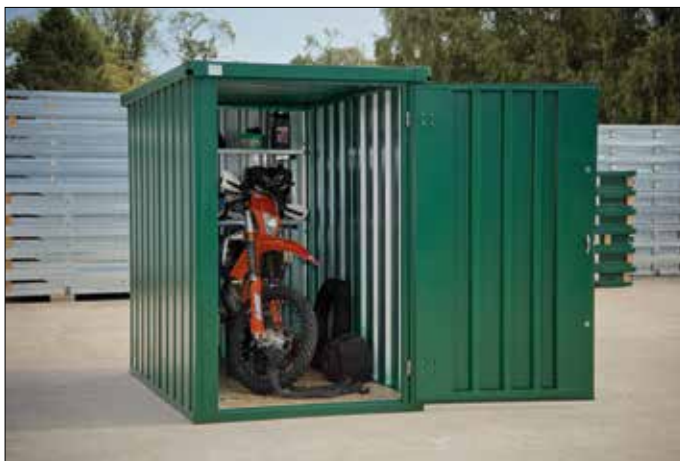
Bikestore - Flat-packed secure storage unit for cycles, motorcycles and tools.