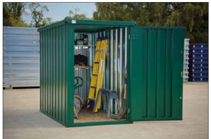
Gardenstore - Flat-packed secure storage unit for all your garden equipment.

The Expandarange of flat-packed buildings is available from: