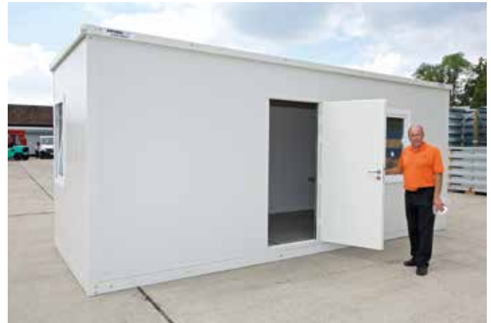
Expandacom - Flat-packed office/ accommodation unit