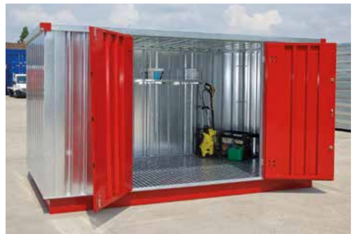
Expandachem - Flat-packed storage unit for the safe storage of chemicals and lubricants.