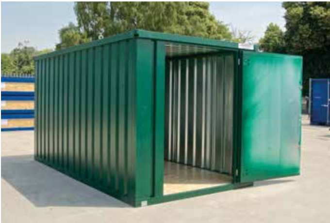
Expandastore - Flat-packed storage unit