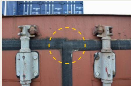
Container Not Level

Looking at the doors of the container, you will see a black seal running around the edges of the doors. If the seal does not run smoothly around the edges of the doors when they are closed, this could mean the container is not level.