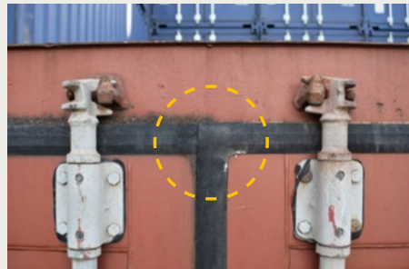
Container Is Level